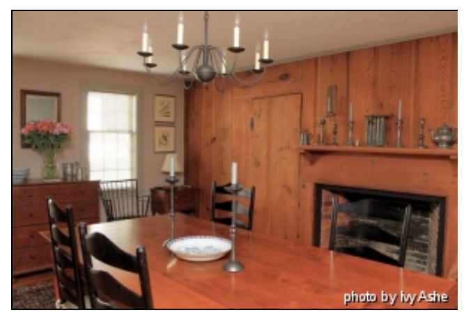
The dining room used to be the kitchen.

Overall, the couple said, they weren't trying to change the house much. "We