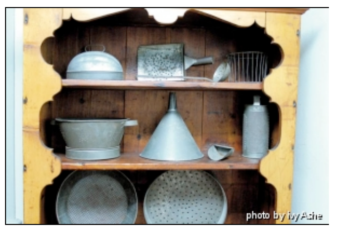
In addition to renovating, the Tankards added personal touches.

Outside the house is a small garden with perennials, and a rebuilt white fence, where roses and honeysuckle bloom in the summer. The couple added a screened-in porch that is surrounded by hydrangeas, a "protected and private space," Mrs. Tankard said. A garden trowel door knocker hints at the interests of the home's inhabitants, and a garden shed in the back is ready for climbing flowers.